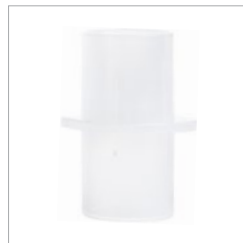
22F- 22F Adaptor