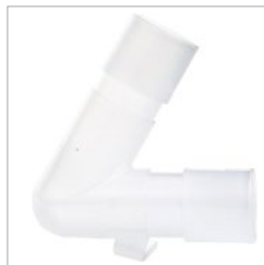
GE Carestation Connector