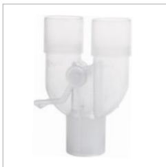
Adult Fixed Y Connector with Gas sampling Port