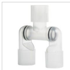
Main body for Adult Swivel Y-No Port