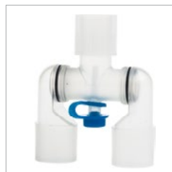
Main body for Adult Swivel Y