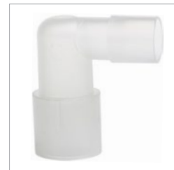
90°deg Elbow Connector-No Port