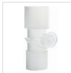
ICU Inspiratory Patient end adaptor with temperature port