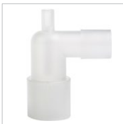
90 deg Elbow Connector with CO 2 Port